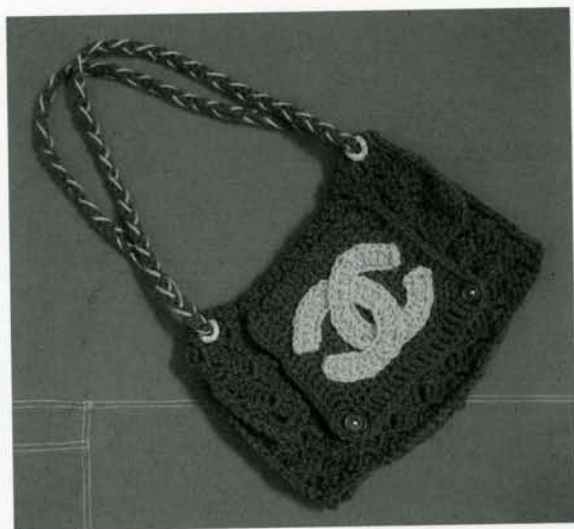
STEPHANIE SYJUCO, THE COUNTERFEIT CROCHET PROJECT [Critique of a Political Economy], organized by STEPHANIE SYJUCO

One indication of the energy of this new movement is the large number of manifestoes being issued by its participants. Here are just a few that I've come across: " The Revolutionary Knitting Circle: Proclamation of Constructive Revolution ", " Manifesto " by Whipup, " Handmade Manifesto ", " Crafter Manifesto " and " Craftifesto ". It's interesting to me that the world of craft has adopted a strategy from the world of avant-garde art to promote its agenda, and it further suggests that the divide between the two worlds is becoming increasingly blurred. To issue a manifesto is a political act — it's an open declaration of a group's intent, what they're for